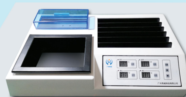
Water Bath-Slide Drier Workstation