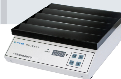
Slide Drying Hotplates